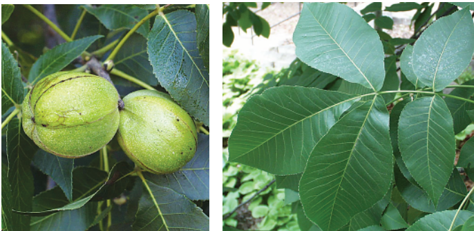
*Paul Wray, Iowa State University

Leaves are compound with 5 to 7 leaflets, but the plant has an alternate branching habit. Fruit are hard-shelled nuts in a green husk.