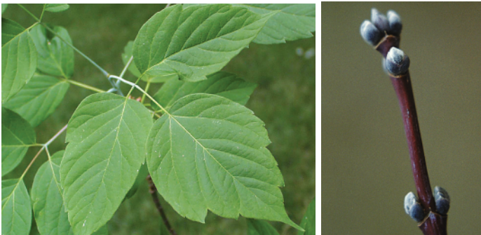
*Paul Wray, Iowa State University

Exhibits opposite branching and compound leaves. However, has 3 to 5 leaflets (instead of 5 to 11) and the samaras are always in pairs instead of single like the ash.