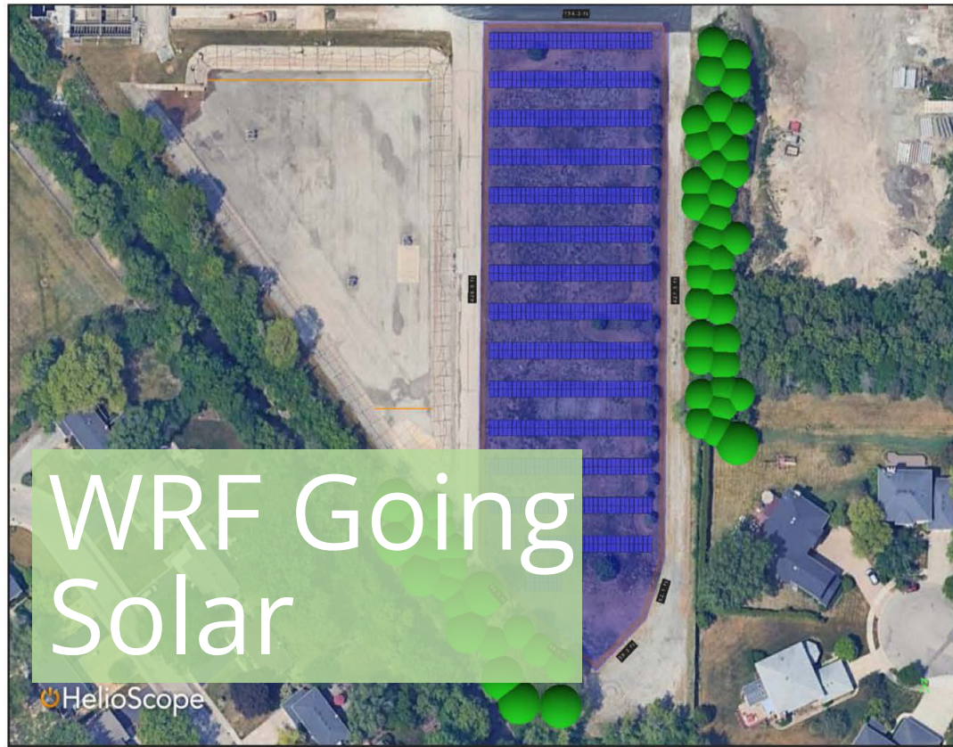
Rendering of new solar array at Water Reclamation Facility.

Approximate Array Footprint: 450' x 150' Area: 67,500'