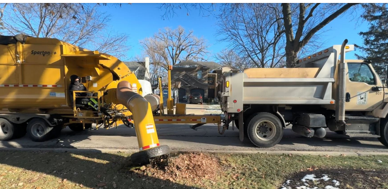
Public Works crews collecting leaves.