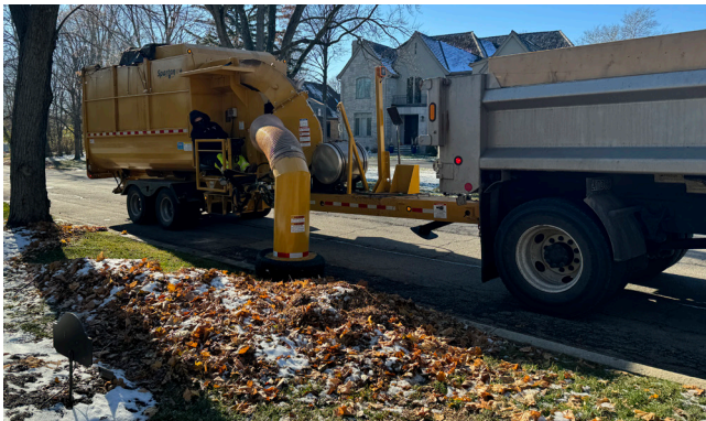
Public Works collecting leaves.