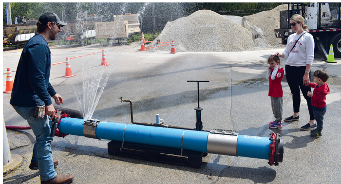
Residents learned about water main breaks at the Public Works Open House in May.

For more information, contact the Engineering Department at 847.317.2490.