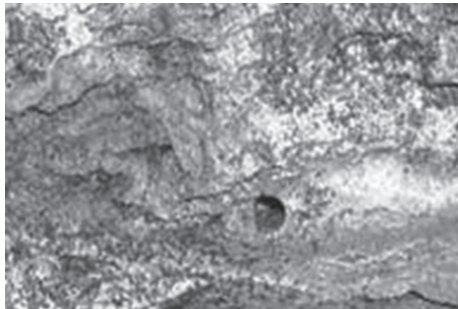
Hole from Two-Lined Chestnut Borer