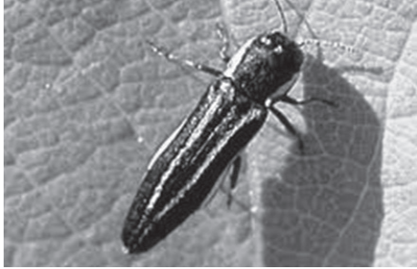
Two-Lined Chestnut Borer

For more information and ways that you can help prevent two-lined chestnut borer, please visit our website at: http://www.deerfield.il.us/827/Two-lined-Chestnut-Borer or by contacting the Public Works Department at (847) 317-7245. ♪