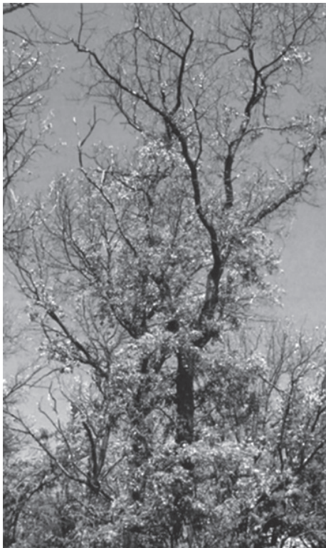
Tree damaged by Two-Lined Chestnut Borer