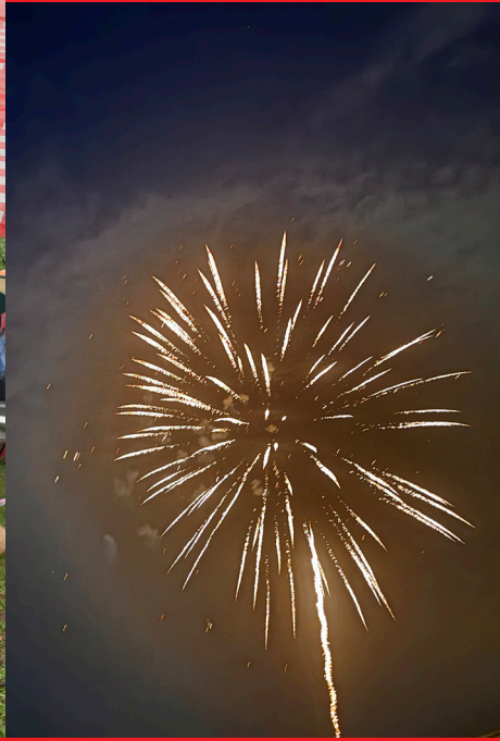
SOMETHING FOR EVERYONE