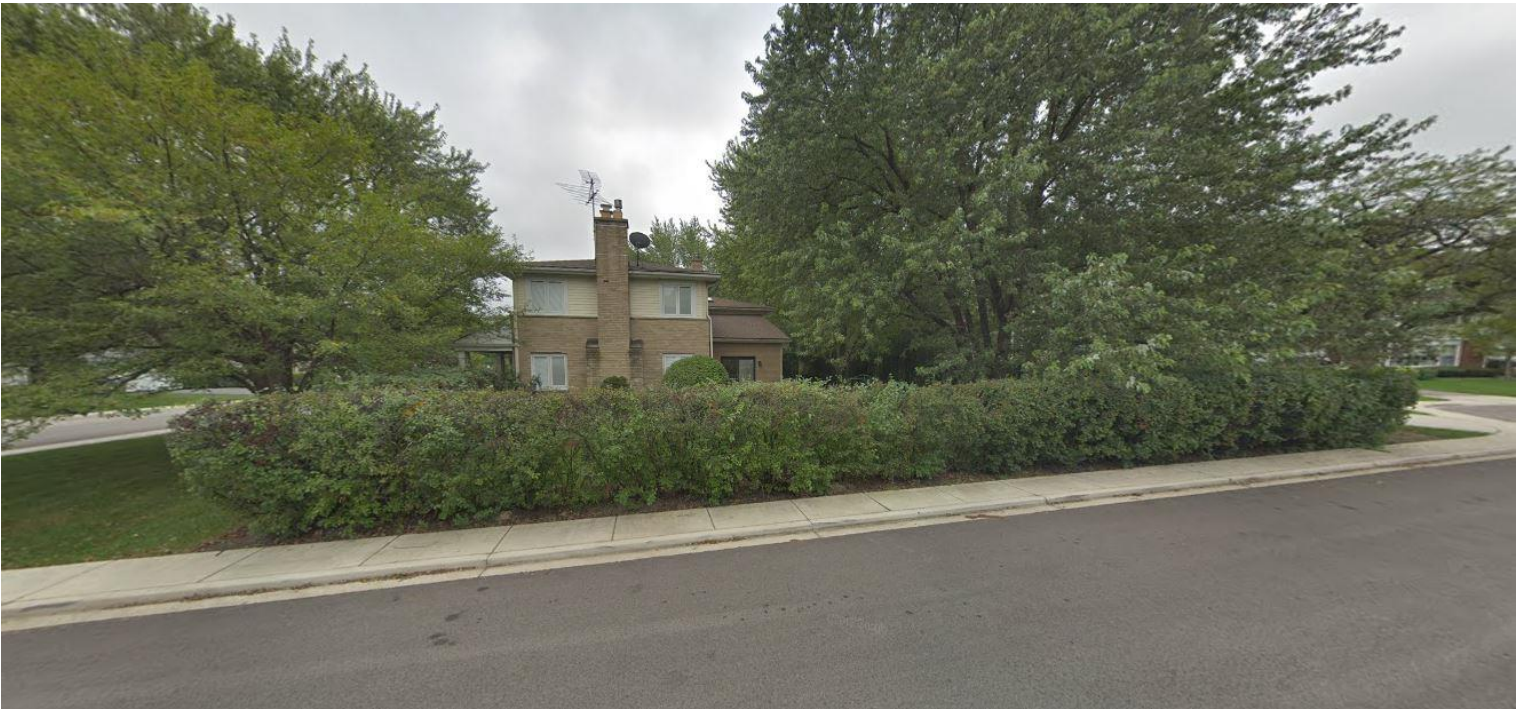
Terrace Court: View #2