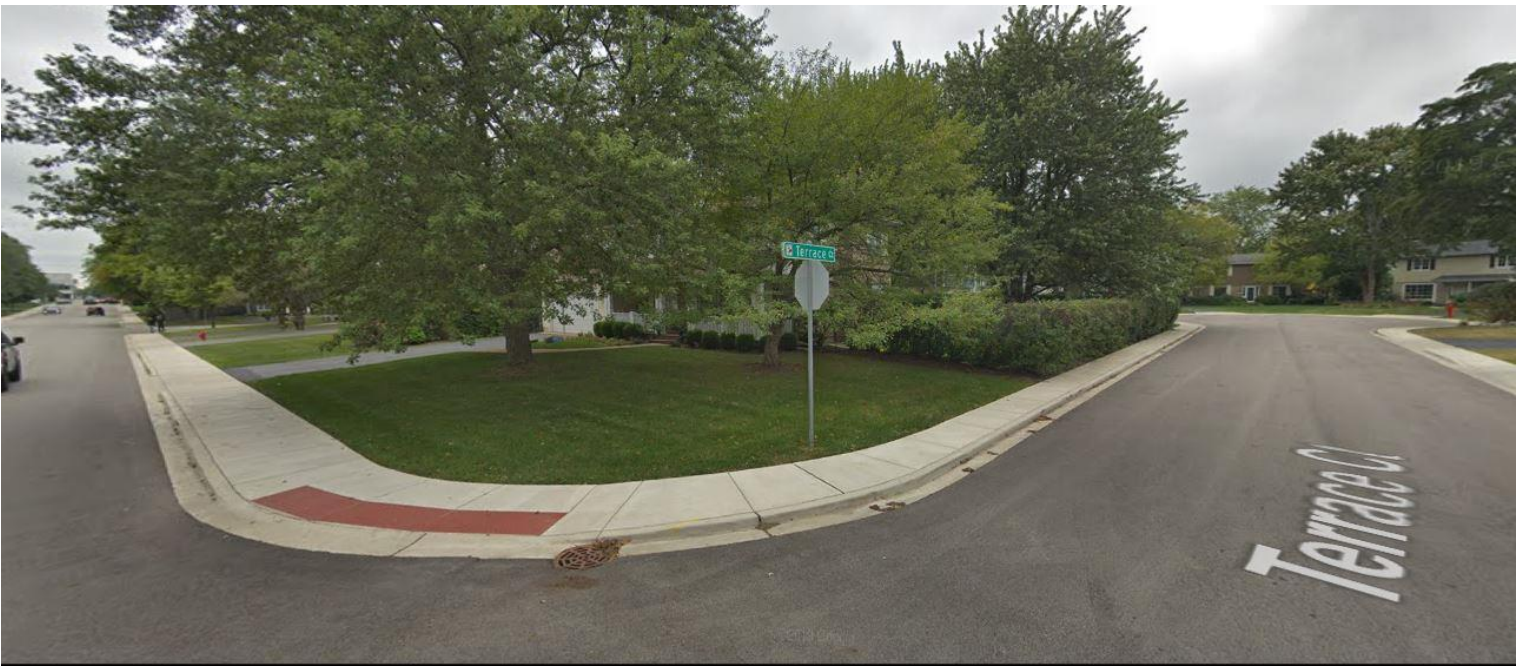
Terrace Court: View #1